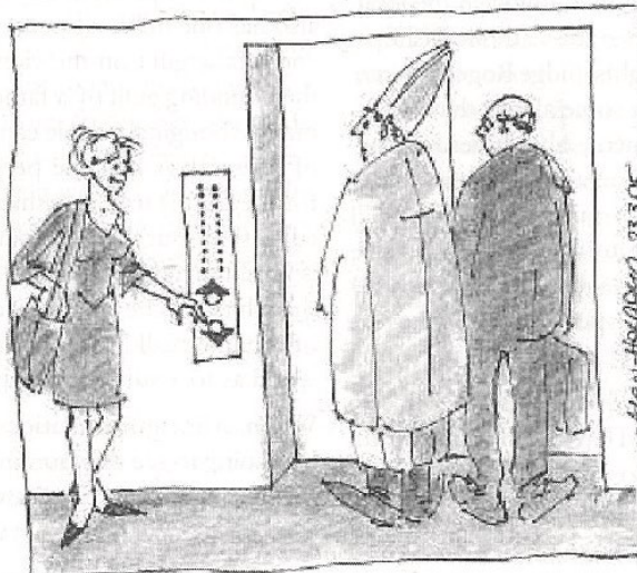
UP OR DOWN?

Authoritarian authority is alive and well in our churches today. In contrast the Gospel message is one of freedom and life. But for many people looking to come to belief, the institutional religion is what they encounter and are turned off, and remain in unbelief. □